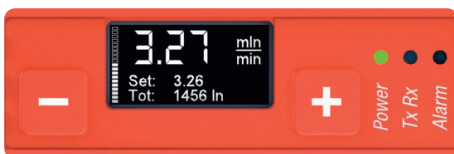
Fig.2 Display SETSPOT with default parameters and +/- buttons to adjust the setpoint