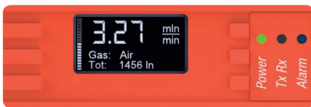
Fig.1 Display SPOT with default parameters